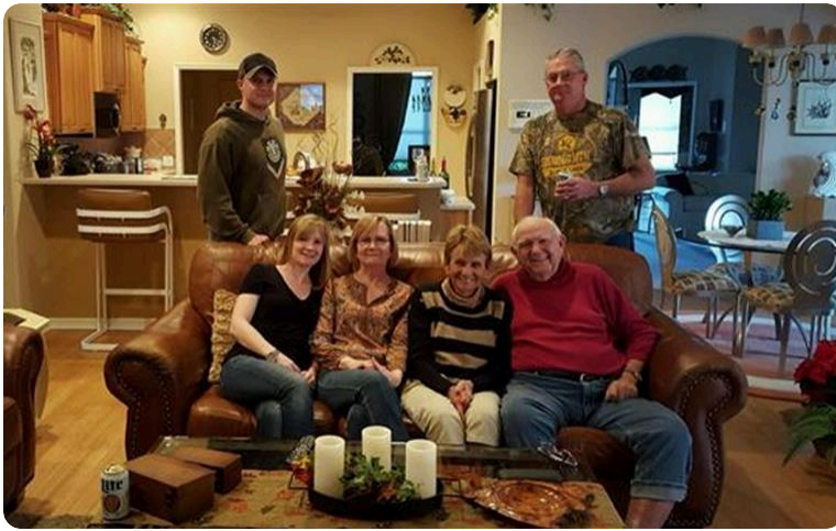
Florida visit 2015 with the Richter's