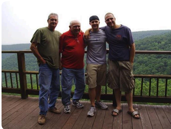
Dad and the boys on PA mountain top.